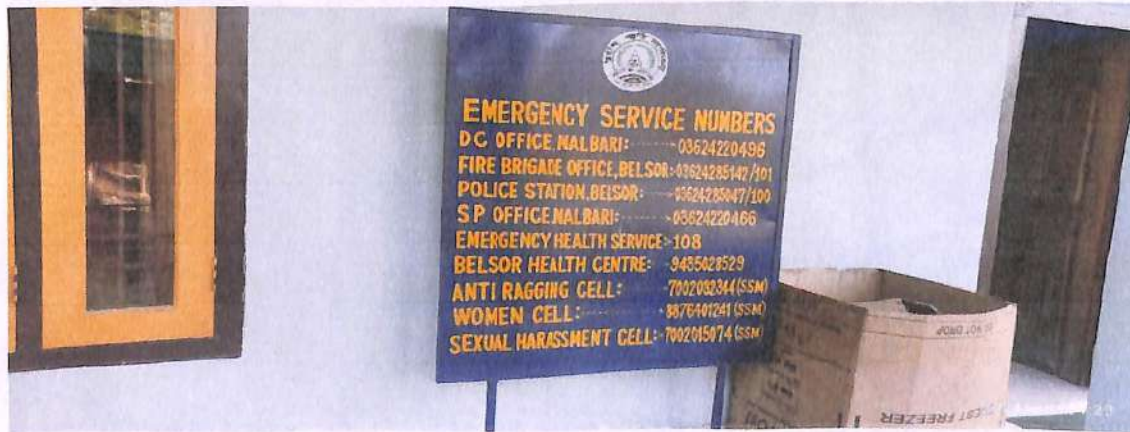
Emergency Service Help Number