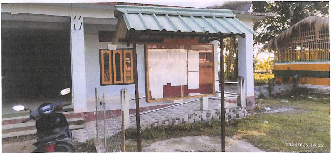
Student's Notice Board & Ramp