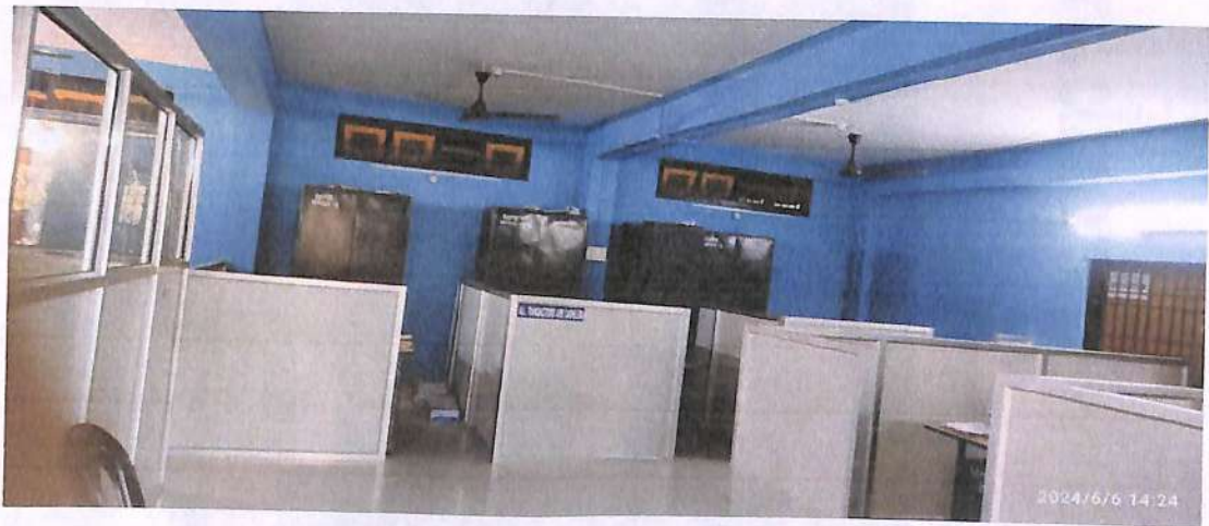
Inside scenario of Office