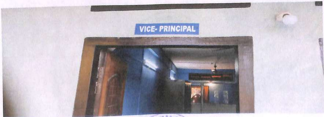
Principal's, & vice-principal's chamber