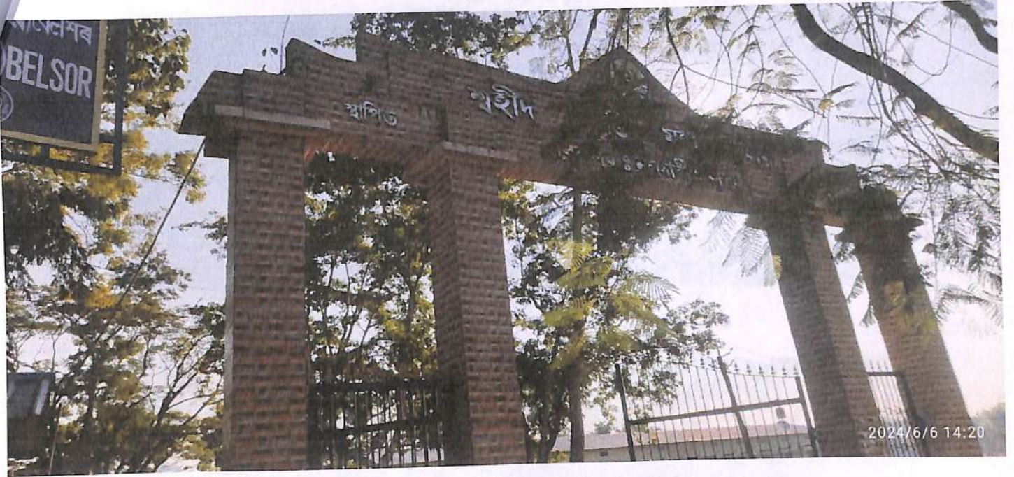
Swahid Smriti Mahavidyalaya, Belsor Main Gate