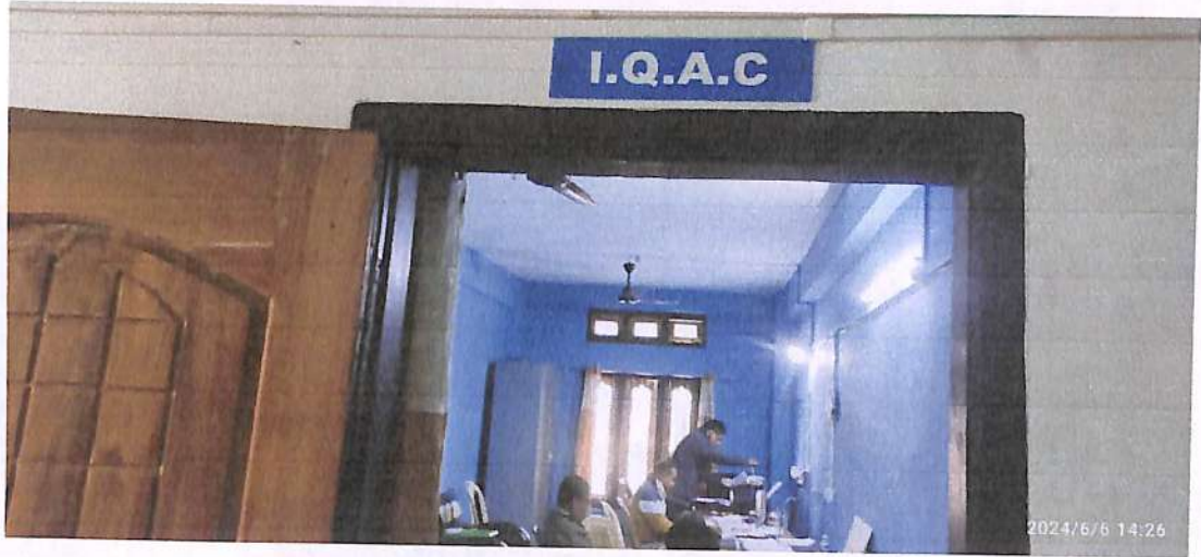
I.Q.A.C . Swahid Smriti Mahavidyalaya, Belsor